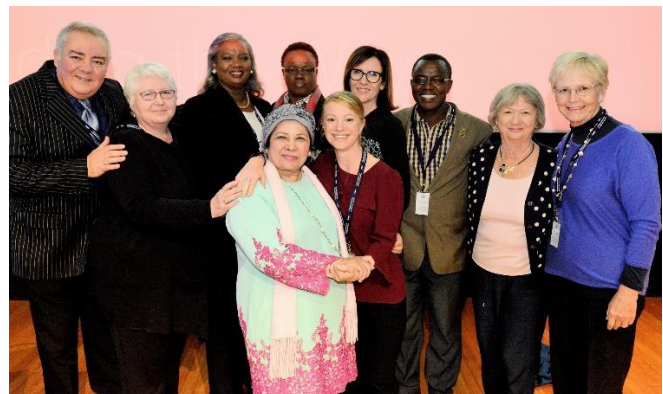
The incoming CNMF Board