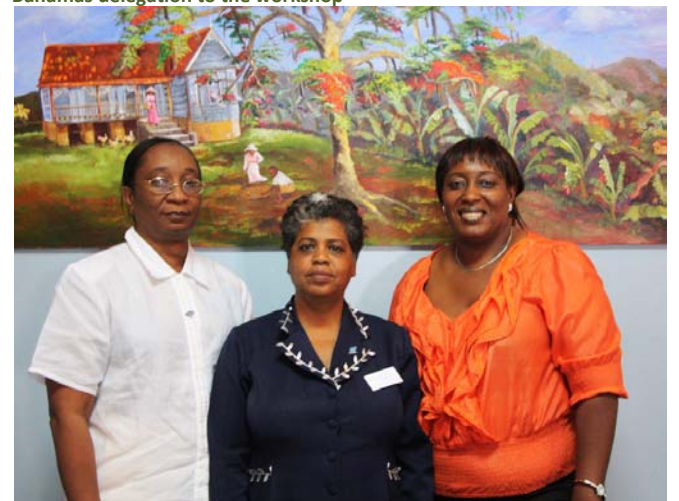
St Lucia delegation to the workshop