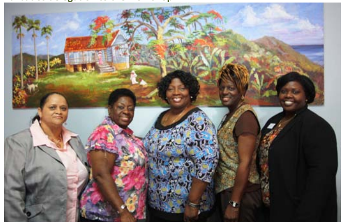
Bahamas delegation to the workshop