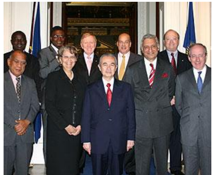
Members of the Commonwealth Eminent Persons Group

The EPG, which received 230 submissions, is calling for the Commonwealth to speak publicly and to act with greater authority on serious or persistent violations of Commonwealth values, including democracy, the rule of law, and human rights.