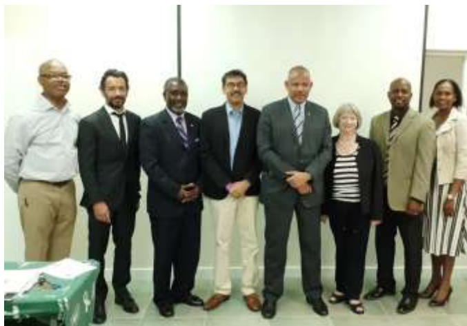
Mental Health Legislation Workshop Bahamas June 2019

The CNMF is continuing to work with selected Commonwealth countries to reform their mental health legislation. New mental health legislation is before the Parliament in the Seychelles and new legislation has also been presented by the Attorney General's Chambers in Botswana for public comment. The CNMF, supported by the Commonwealth Secretariat, is currently working with a National Mental Health Advisory Committee established by the Government of the Bahamas to write new mental health legislation for the Bahamas. The CNMF attended a preliminary workshop to develop an outline for the new legislation in June 2019. The workshop was opened by the Bahamas Minister for Health, the Hon Dr Duane Sands. It is anticipated that the work on supporting the reform mental health legislation will continue with other countries in the Commonwealth.