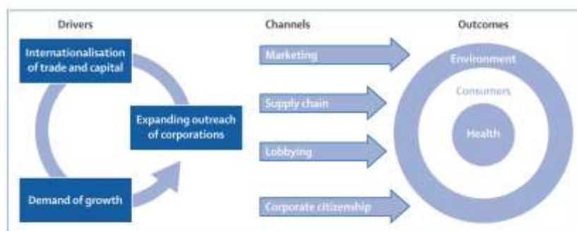
Figure: Dynamics that constitute the commercial determinants of health

The CNMF, as an elected executive member of the Commonwealth Health Professions and Partners Alliance (CHPA), and in partnership with the Commonwealth Foundation and other civil society organisations hosted the 2021 Commonwealth Civil Society Forum (CCSPF) in May 2020 which was organised by the Commonwealth Medical Association.