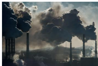
Air pollution and climate change

The WHO have identified ten threats to global health. The World Health Organization's new 5-year strategic plan begins in 2019 and will address these and other threats. The plan focuses on a triple billion target: ensuring 1 billion more people benefit from access to universal health coverage; 1 billion more people are protected from health emergencies; and 1 billion more people enjoy better health and well-being. To find out how nurses and midwives can contribute to the triple billion targets go to: https://www.who.int/emergencies/ten-threats-to-global-health-in-2019 .