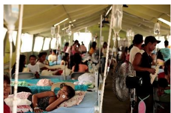
Weak primary health care