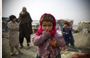
Fragile and vulnerable settings