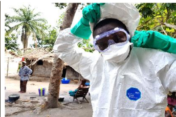
Ebola and other pathogens