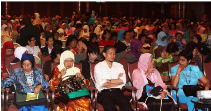
Delegates at the MNA 60 th AGM