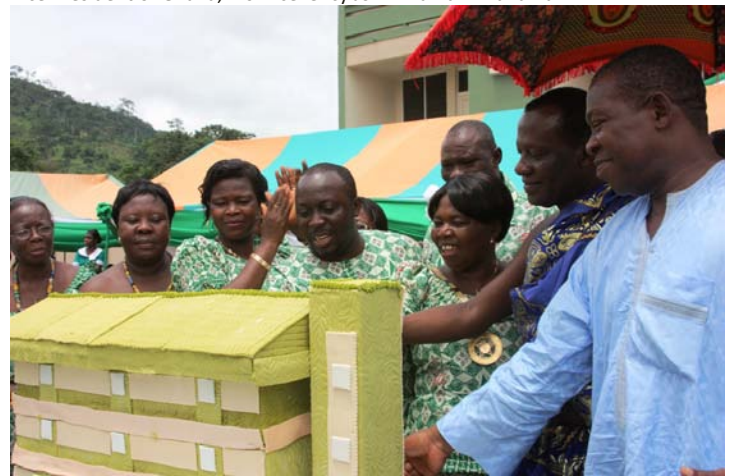
GRNA executive members cutting the Anniversary cake