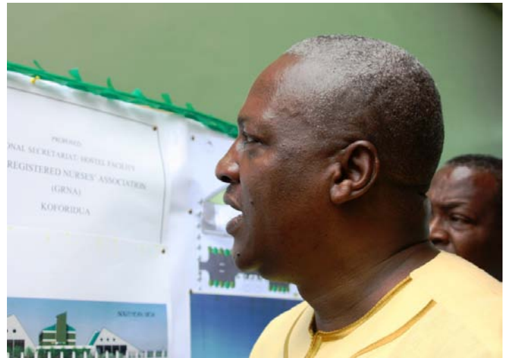
Vice President of Ghana, His Excellency John Dramani Mahama