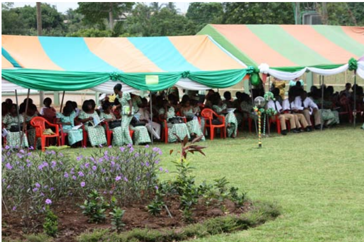
GRNA members at the 50 th Golden Jubilee celebrations

On 16 April in Koforidua, Ghana, the Ghana Registered Nurses Association (GRNA) celebrated 50 years of looking after the nurses and the people of Ghana. The Vice President of Ghana, His Excellency John Dramani Mahama, was the guest of honour at the 50 th Golden Jubilee celebrations where a second GRNA hostel and conference centre was officially opened.