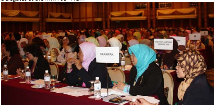
Delegates at the MNA 60 th AGM