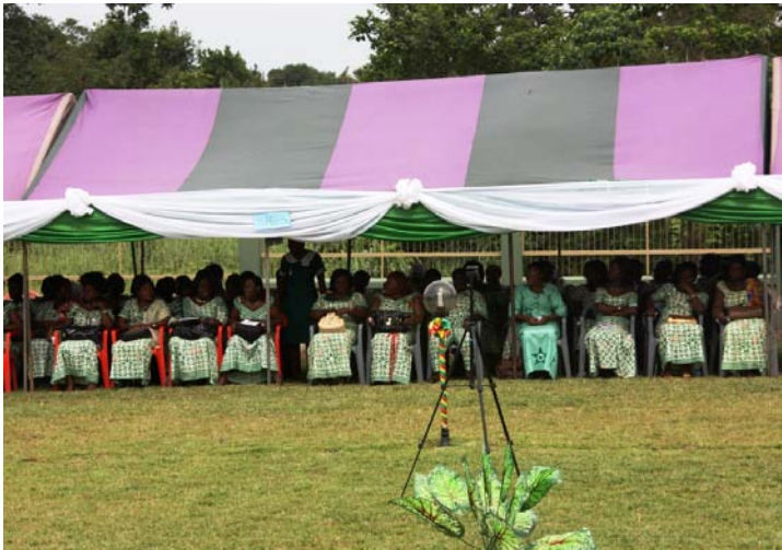
GRNA members at the 50 th Golden Jubilee celebrations