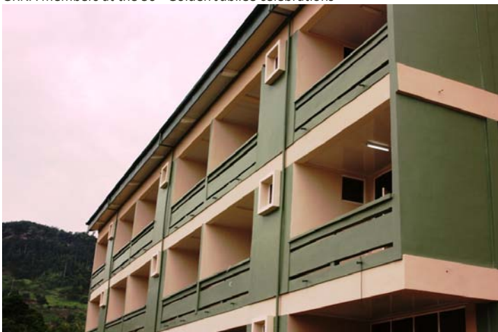
The new GRNA hostel