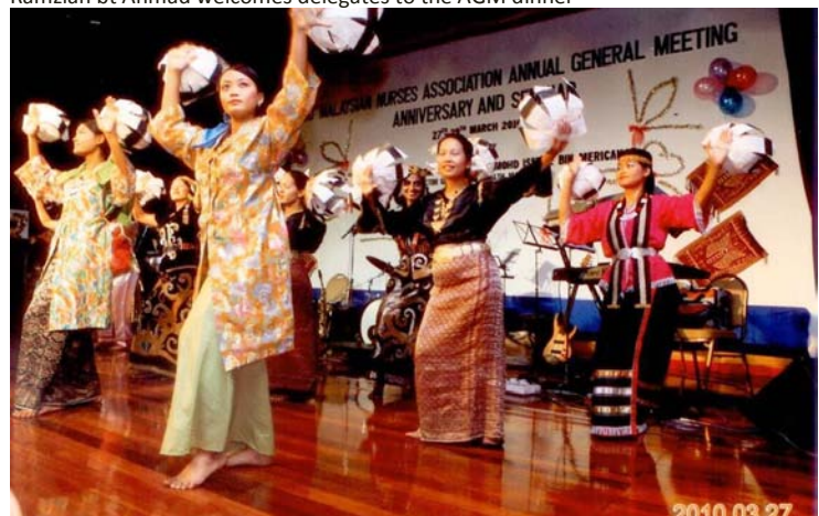
Nursing students entertain delegates at the dinner with traditional dance