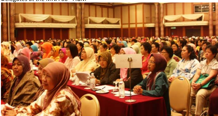
Delegates at the MNA 60 th AGM

The CNF congratulates the MNA on a successful 60 years and wishes them well for a further 60 years.