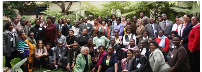
ARC Year 2 Summative Congress Johannesburg South Africa June 2012

The second ARC Summative Congress was held in Johannesburg South Africa in June 2012. In ARC Year 2, six countries were awarded small grants. Botswana and Tanzania developed national CPD frameworks; Uganda commenced work on scopes of practice for nurses and midwives; Kenya commenced deregulation of their nursing and midwifery regulatory Council functions; Swaziland implemented the CPD framework they developed in Year 1; and Zimbabwe enhanced the implementation of their national CPD framework.