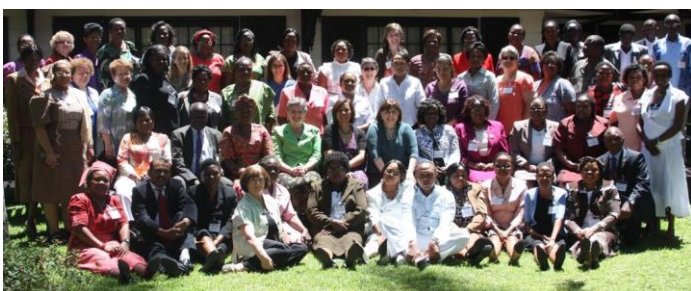
ARC Year 1 Summative Congress Nairobi Kenya February 2011

The first ARC Summative Congress was held in Nairobi Kenya in February 2011. Five countries were awarded small grants in ARC Year 1 to work on regulatory improvements in their country. Seychelles and Mauritius made changes to their nursing and midwifery Act while Lesotho and Swaziland developed national CPD frameworks for nurses and midwives and Malawi enhanced the implementation of their existing national CPD framework.