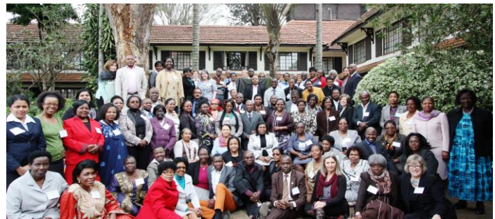
ARC Year 3 Summative Congress Nairobi Kenya July 2013

The third ARC Summative Congress was held in Nairobi Kenya in July 2013. The success of the ARC initiative attracted further funding for Year 3 enabling ten countries to be awarded small grants. The awarding of the grants is a competitive process. The successful countries will be announced in September.