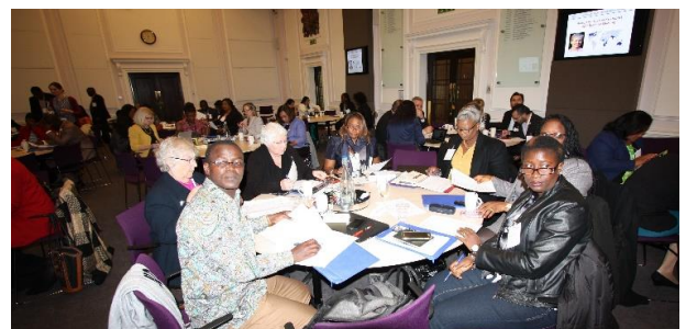
CNMF Biennial March 2016