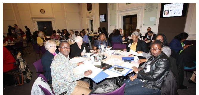
CNMF Biennial March 2016