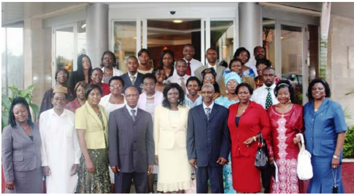
Participants at the Yaounde workshop

The CNF, in conjunction with the Cameroon Nurses Association, held two very successful workshops in the 4 Safety series in Yaounde 5-6 July and Bamenda 8-9 July 2010. Forty three nurses attended the Yaounde workshop and 48 nurses attended the Bamenda workshop. Delegates considered key factors essential to ensure patient safety; discussed strategies to make their workplaces safer; debated issues around whether nursing in Cameroon was a safe profession; and reflected on their own capacity to be a safe nurse.