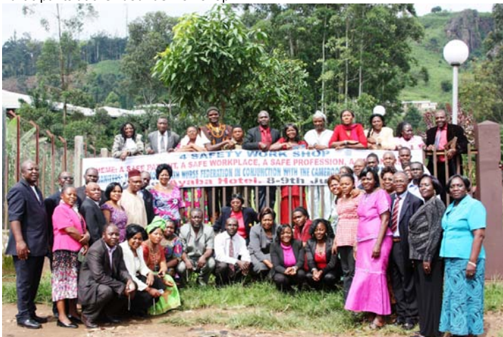
Participants at the Bamenda workshop